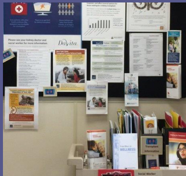
A. Holly Patterson/Nassau University Medical Center (Uniondale, NY)